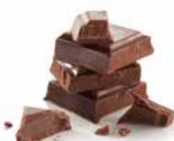
B Dark Chocolate