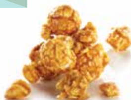
A Caramel Corn

TRY THESE COMPLEMENTARY TOPPINGS TO BRING OUT THE SWEET AND SALTY FLAVORS OF OUR PREMIUM ICE CREAM