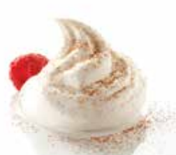
D Whipped Cream