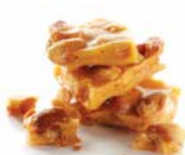
C Peanut Brittle