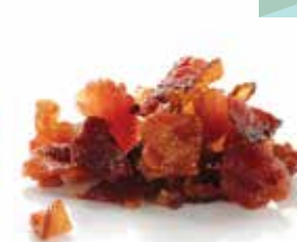
F Bourbon Bacon

Recipes available online at foodservedirectorder.com