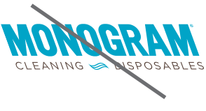
Do not skew.