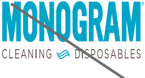
Do not scale disproportionately.