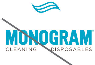
Do not remove or change the graphics elements.