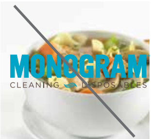
Do not place on top of busy photography or background color.