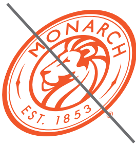
Do not skew.