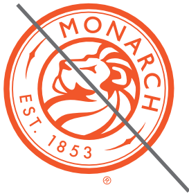
Do not rotate the logo.