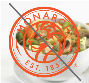
Do not place on top of busy photography or background color.