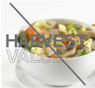
Do not place on top of busy photography or background color.