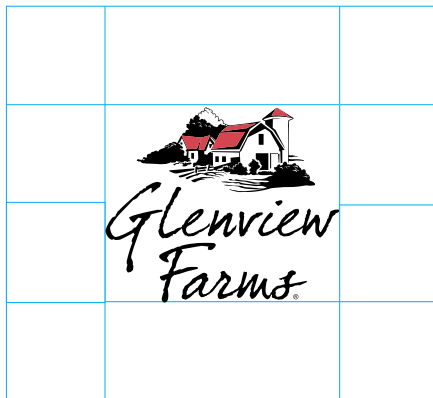
Protected space = half of diameter

For brand-related marketing collateral, the brand should appear on the left. For product-specific Glenview Farms® items, the brand should appear on the right, or where space is available.