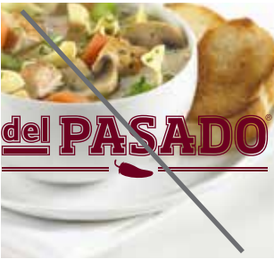
Do not place on top of busy photography or background color.