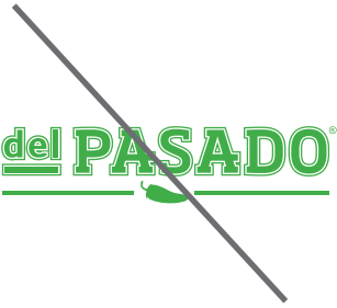
Do not change the color.