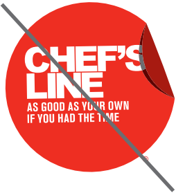
Do not rotate the logo.