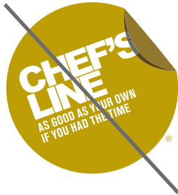
Do not change the color