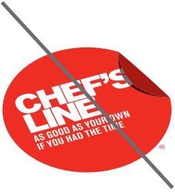
Do not scale disproportionately.