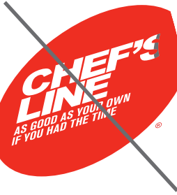
Do not skew.