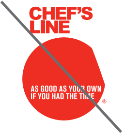
Do not remove or change the graphics elements.