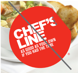
Do not place on top of busy photography or background color.