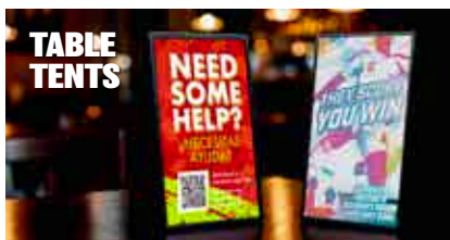
TABLE TENTS | TO-GO BAG STUFFERS MENU INSERTS | KIDS MENUS

Pre-designed menu and marketing pieces in vibrant summer soccer themes for global appeal. Choose your style and quantity, submit your menu text, and we'll customize our designs with your content.